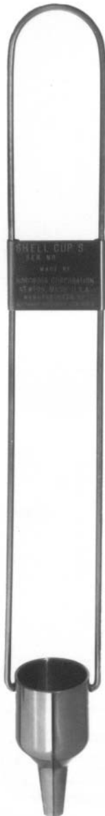
Shell Cup capacity is 23 c.c.

The Shell Cup is a simple, reliable device for measuring the viscosity of a wide range of fluids. Originally developed for use with printing inks, it has found widespread applications as diverse as fuel oil and industrial finishes — for calibrating other viscosity sensors as well as for primary measurements.